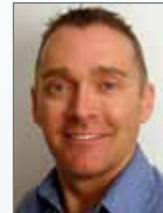
Paul Dillon Drug and Alcohol Research and Training Australia

There is a great deal of mythology around drugs and their use. This presentation will give accurate, up-to-date information on what we know about young people, alcohol and drugs in Australia. It will empower parents with basic information about current trends in alcohol and other drugs. It will help them to have meaningful conversations with their child and develop strategies to minimise the harms and risks associated with drugs and alcohol.